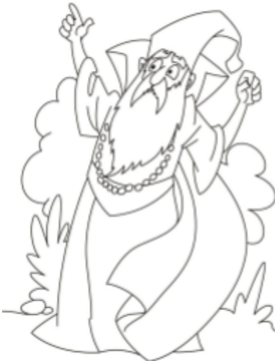
Little Old Man